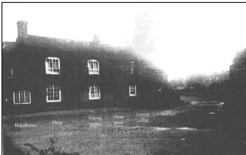
S.J. Way - The Old Bakehouse