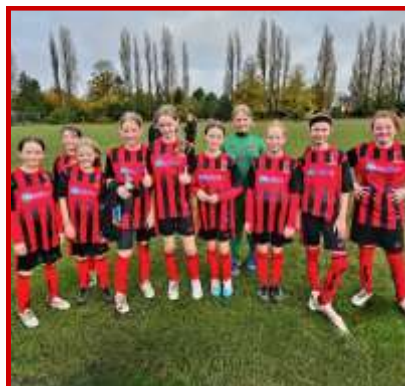
U12's after a fine 5-0 victory over Bourneville