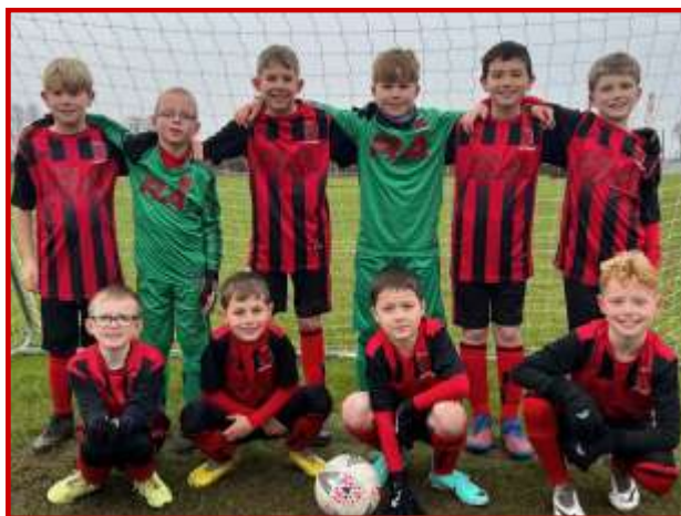
U10's celebrating after a 9-0 win over local rivals