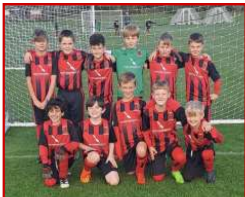
Stockton Juniors FC under 9's